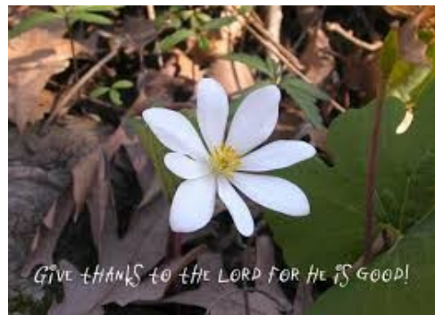
GIVE THANKS TO THE LORD FOR HE IS GOOD!