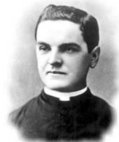
Father Michael J. McGivney (1852-90) -Apostle to the Young, Protector of Christian Family Life & Founder of the Knights of Columbus, Intercede for Us.