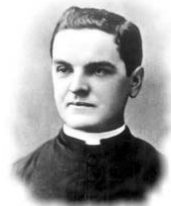
Father Michael J. McGivney (1852-90) -Apostle to the Young, Protector of Christian Family Life & Founder of the Knights of Columbus, Intercede for Us.